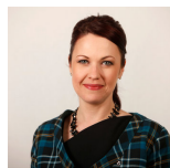
Gail Ross Scottish National Party