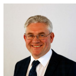
Kenneth Gibson Scottish National Party