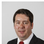
Neil Bibby Scottish Labour