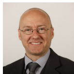
Patrick Harvie Scottish Green Party