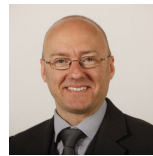
Patrick Harvie Scottish Green Party