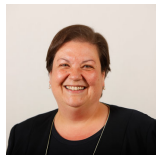
Jackie Baillie Scottish Labour