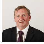
Alex Rowley Scottish Labour