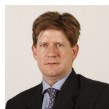
Alexander Burnett Scottish Conservative and Unionist Party