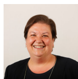
Jackie Baillie Scottish Labour