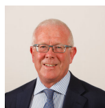
Convener Bruce Crawford Scottish National Party