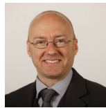
Patrick Harvie Scottish Green Party