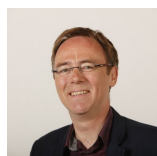
Alasdair Allan Scottish National Party