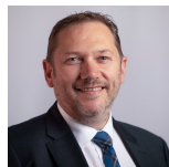
Douglas Lumsden Scottish Conservative and Unionist Party