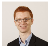
Ross Greer Scottish Green Party