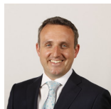
Alex Cole-Hamilton Scottish Liberal Democrats