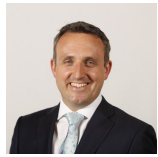
Alex Cole-Hamilton Scottish Liberal Democrats