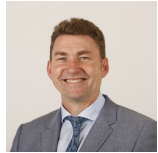
Brian Whittle Scottish Conservative and Unionist Party