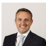
Alex Cole-Hamilton Scottish Liberal Democrats