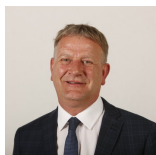
David Torrance Scottish National Party