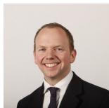
Donald Cameron Scottish Conservative and Unionist Party