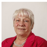
Sandra White Scottish National Party