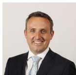
Alex Cole-Hamilton Scottish Liberal Democrats