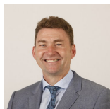
Brian Whittle Scottish Conservative and Unionist Party