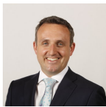
Alex Cole-Hamilton Scottish Liberal Democrats