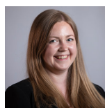
Gillian Mackay Scottish Green Party