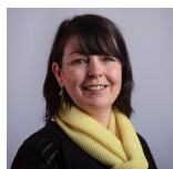
Stephanie Callaghan Scottish National Party