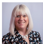
Sue Webber Scottish Conservative and Unionist Party