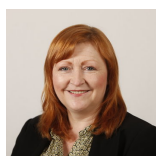
Emma Harper Scottish National Party