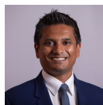
Sandesh Gulhane Scottish Conservative and Unionist Party