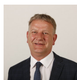
David Torrance Scottish National Party