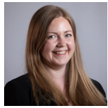
Gillian Mackay Scottish Green Party