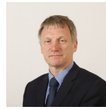
Ivan McKee Scottish National Party