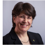
Tess White Scottish Conservative and Unionist Party