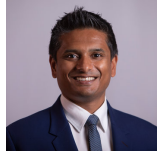
Sandesh Gulhane Scottish Conservative and Unionist Party