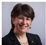
Tess White Scottish Conservative and Unionist Party