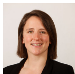
Mairi Gougeon Scottish National Party