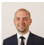
Ben Macpherson Scottish National Party