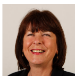
Mary Fee Scottish Labour