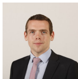
Douglas Ross Scottish Conservative and Unionist Party