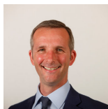
Liam McArthur Scottish Liberal Democrats