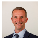
Liam McArthur Scottish Liberal Democrats