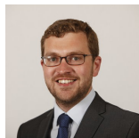
Oliver Mundell Scottish Conservative and Unionist Party