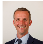
Liam McArthur Scottish Liberal Democrats