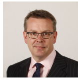
Convener Adam Tomkins Scottish Conservative and Unionist Party