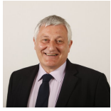
Convener John Finnie Scottish Green Party