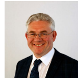
Kenneth Gibson Scottish National Party