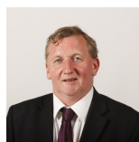
Deputy Convener Alex Rowley Scottish Labour