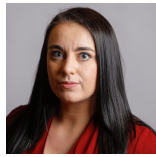
Meghan Gallacher Scottish Conservative and Unionist Party