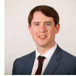
Mark Griffin Scottish Labour