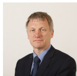
Ivan McKee Scottish National Party