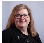
Jackie Dunbar Scottish National Party