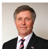
Edward Mountain Scottish Conservative and Unionist Party