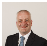
Mark Ruskell Scottish Green Party