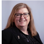
Jackie Dunbar Scottish National Party