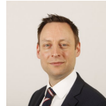
Liam Kerr Scottish Conservative and Unionist Party