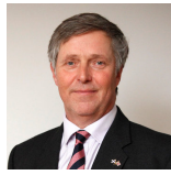
Convener Edward Mountain Scottish Conservative and Unionist Party