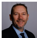
Douglas Lumsden Scottish Conservative and Unionist Party