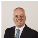
Mark Ruskell Scottish Green Party