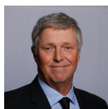
Convener Edward Mountain Scottish Conservative and Unionist Party