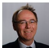
Alasdair Allan Scottish National Party