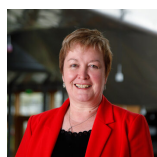
Rhoda Grant Scottish Labour