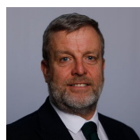
Convener Finlay Carson Scottish Conservative and Unionist Party