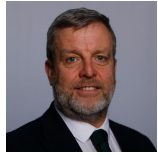
Convener Finlay Carson Scottish Conservative and Unionist Party