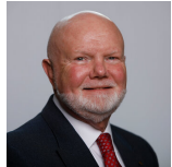
Colin Beattie Scottish National Party