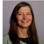
Ariane Burgess Scottish Green Party