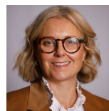
Rachael Hamilton Scottish Conservative and Unionist Party