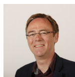
Alasdair Allan Scottish National Party