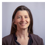
Ariane Burgess Scottish Green Party