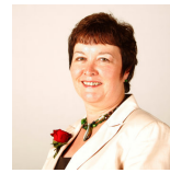
Rhoda Grant Scottish Labour