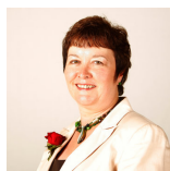
Rhoda Grant Scottish Labour