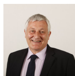
John Finnie Scottish Green Party