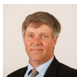
Convener Edward Mountain Scottish Conservative and Unionist Party