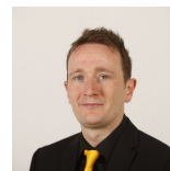
Fulton MacGregor Scottish National Party