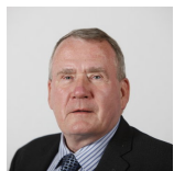
Richard Lyle Scottish National Party