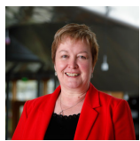
Rhoda Grant Scottish Labour