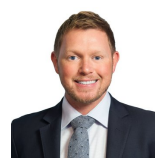
Jamie Greene Scottish Conservative and Unionist Party