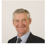
Peter Chapman Scottish Conservative and Unionist Party