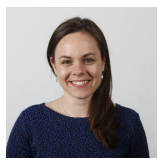
Kate Forbes Scottish National Party