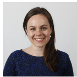
Kate Forbes Scottish National Party