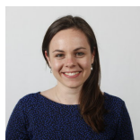
Kate Forbes Scottish National Party