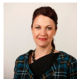
Deputy Convener Gail Ross Scottish National Party