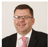
Colin Smyth Scottish Labour