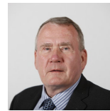
Richard Lyle Scottish National Party