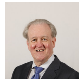
Stewart Stevenson Scottish National Party