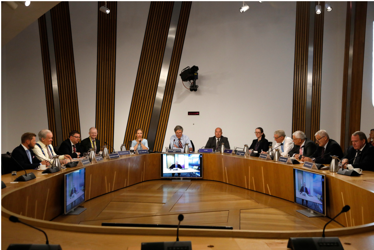
Video conference with the Secretary of State for Environment, Food and Rural Affairs on 27 June 2018.