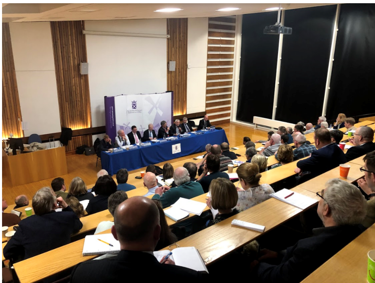
Informal discussion event in Galashiels on 23 January 2019.