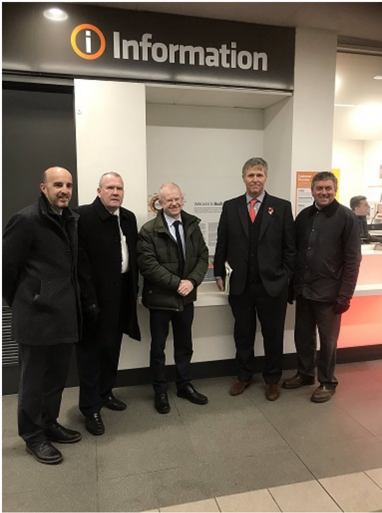
Members on a visit to Strathclyde Partnership for Transport on 2 November 2018.