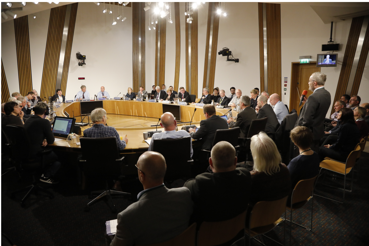
Discussion forum event in the Scottish Parliament on 24 October 2018.