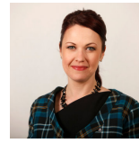
Deputy Convener Gail Ross Scottish National Party