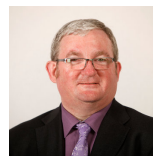
Angus MacDonald Scottish National Party