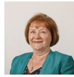
Deputy Convener Maureen Watt Scottish National Party