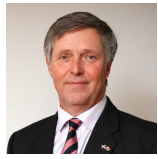
Convener Edward Mountain Scottish Conservative and Unionist Party