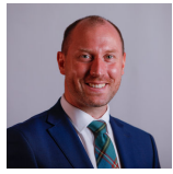
Convener Neil Gray Scottish National Party