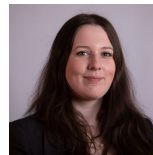
Emma Roddick Scottish National Party