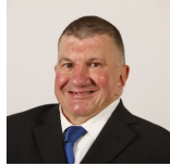
Jeremy Balfour Scottish Conservative and Unionist Party