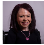
Pam Duncan-Glancy Scottish Labour