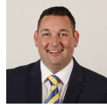
Miles Briggs Scottish Conservative and Unionist Party