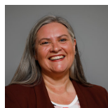
Roz McCall Scottish Conservative and Unionist Party