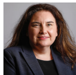
Katy Clark Scottish Labour