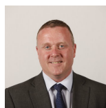
Deputy Convener Bob Doris Scottish National Party