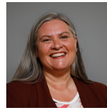
Roz McCall Scottish Conservative and Unionist Party