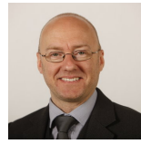
Deputy Convener Patrick Harvie Scottish Green Party