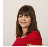
Clare Haughey Scottish National Party