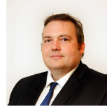
Jamie Halcro Johnston Scottish Conservative and Unionist Party