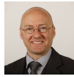
Deputy Convener Patrick Harvie Scottish Green Party