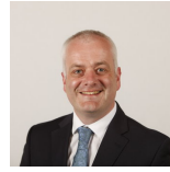
Deputy Convener Mark Ruskell Scottish Green Party