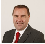
Neil Findlay Scottish Labour