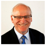
Gil Paterson Scottish National Party