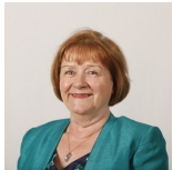
Maureen Watt Scottish National Party